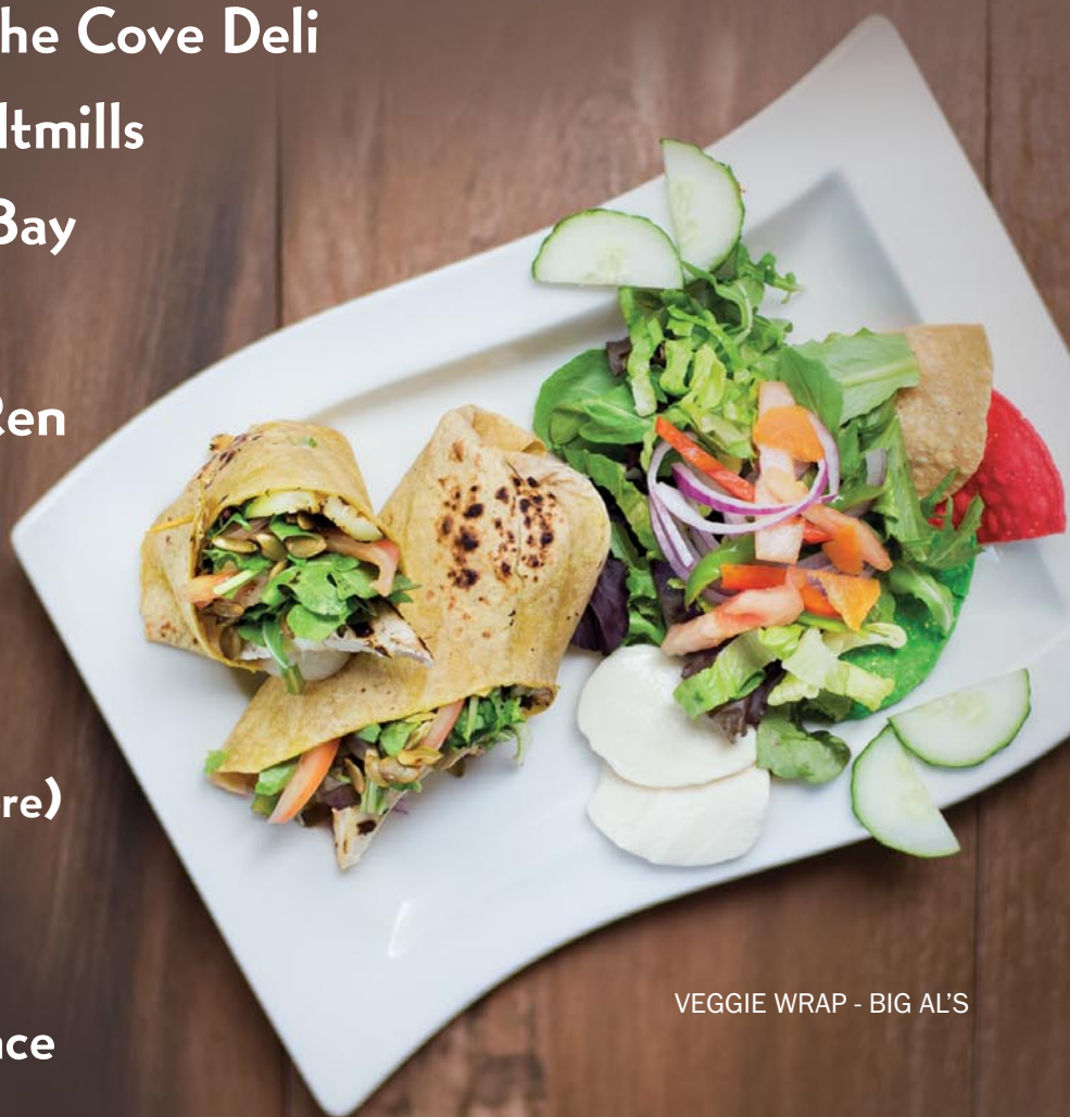
VEGGIE WRAP - BIG AL'S